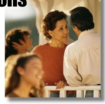
table. Try the following tips to help make your get-togethers a little merrier: 1) steer conversations that appear to be drifting into conflict toward those things you can agree on; 2) if you are angry about what's in the news, avoid displacing this tension onto loved ones; 3) challenge yourself to be a tension deescalator, not an aggravator; and 4) rehearse how you might respond to conflict because doing so will dramatically improve your ability to act calmly while avoiding hair-trigger reflexes.

he annual Stress in America survey consistently reports strain among families caused by their ideological differences, and the holidays have a keen reputation for these conflicts, even at the dinner