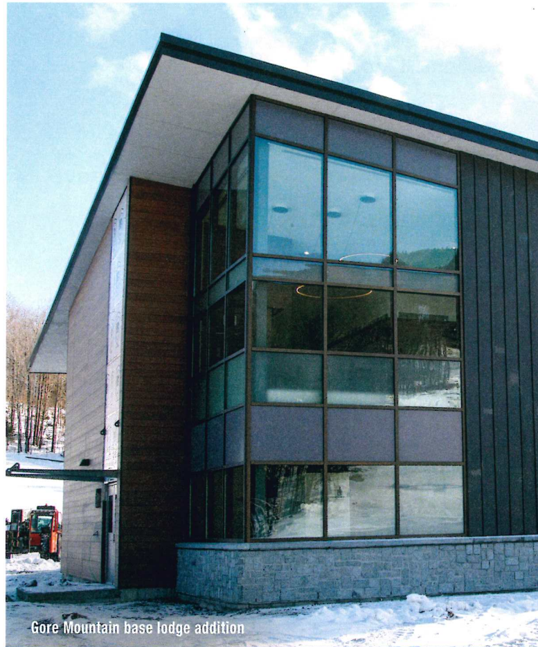
Gore Mountain base lodge addition

Gore was recently recognized for battling climate change: the operation has a 25-year purchase agreement to obtain power from a large 1,500-panel solar array and is also committed to ongoing snowmaking efficiencies and widespread use of LED lighting.