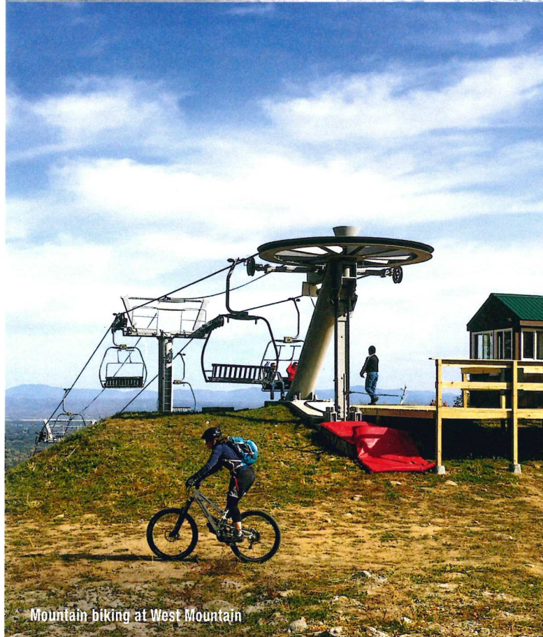
Mountain biking at West Mountain

The ski area in southern Warren County recently upgraded one of its three chairlifts, improving accessibility and capacity, as well as comfort. In addition, the mountain has begun work on a $2 million zipline and treetop aerial mountain adventure at the summit, both with the intention of transforming the resort into a year-round destination. West Mountain also offers mountain biking. EDC assisted West Mountain in obtaining CFA funding.