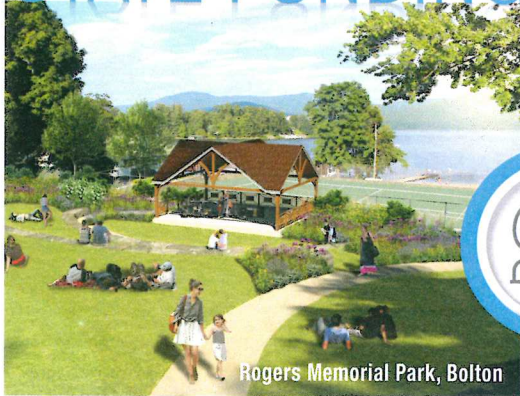
Rogers Memorial Park, Bolton