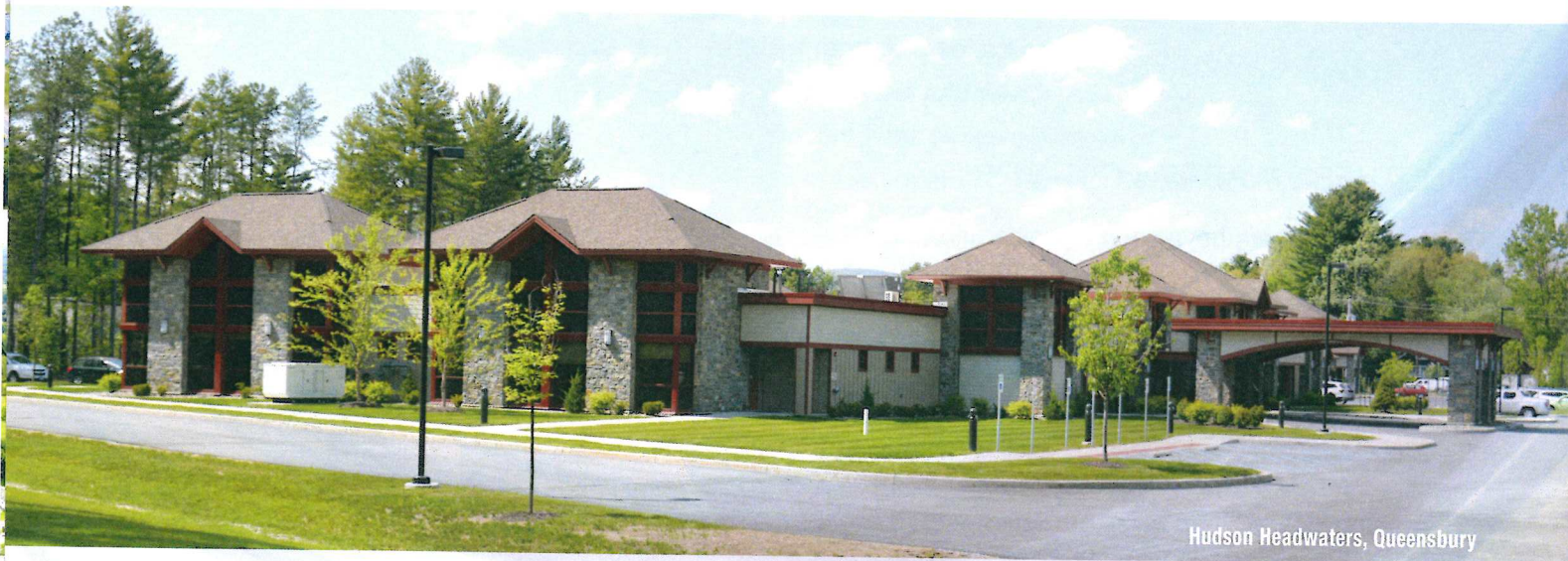
Hudson Headwaters, Queensbury