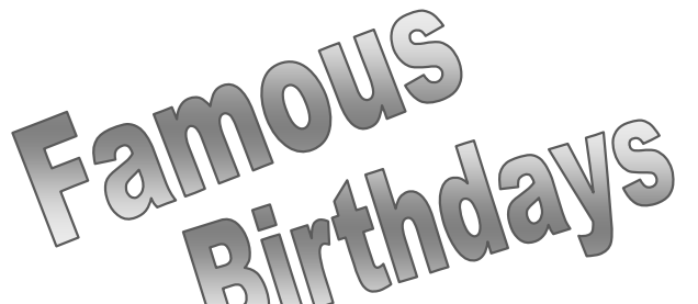
7<sup>th</sup> Simon Cowell – Brutally Honest celebrity judge on TV's "American Idol"

* SAMHAINOPHOBIA IS AN INTENSE FEAR OF HALLOWEEN.