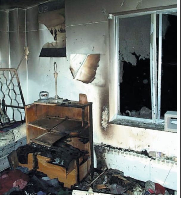
Dormitory room fire caused by candles.